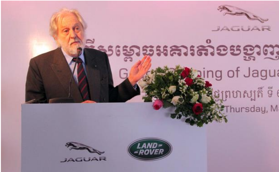
The Lord Puttnam CBE addressed his speech during his first visit to Cambodia in March 2014.

"I am delighted to be returning to Cambodia for my second visit in my role as the Prime Minister's Trade Envoy to Cambodia," he said in the statement before the visit.