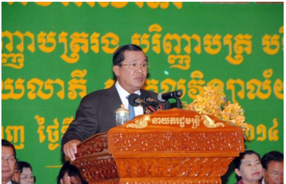
Prime Minister Hun Sen presides over the graduation ceremony of 6,748 graduates from Cambodian University for Specialties (CUS).

Prime Minister Hun Sen said it is necessary for Cambodia to conduct more reform in order to meet the development need and the regional and international competitiveness.