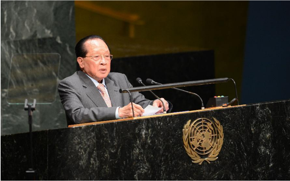
Deputy Prime Minister HOR Namhong, Minister of Foreign Affairs and International Cooperation addresses his speech at the 69th Session of the United Nations General Assembly on 29 September 2014 in New York.

In combating HIV/AIDS, he added, Cambodia has made great stride by progressively reducing HIV prevalence to 0.6 percent in 2013. To achieve this indicator, the Cambodian government has further adopted a policy of "Getting to Zero" aiming to realize Zero new infections, Zero AIDS-related deaths, and Zero discrimination by 2020.