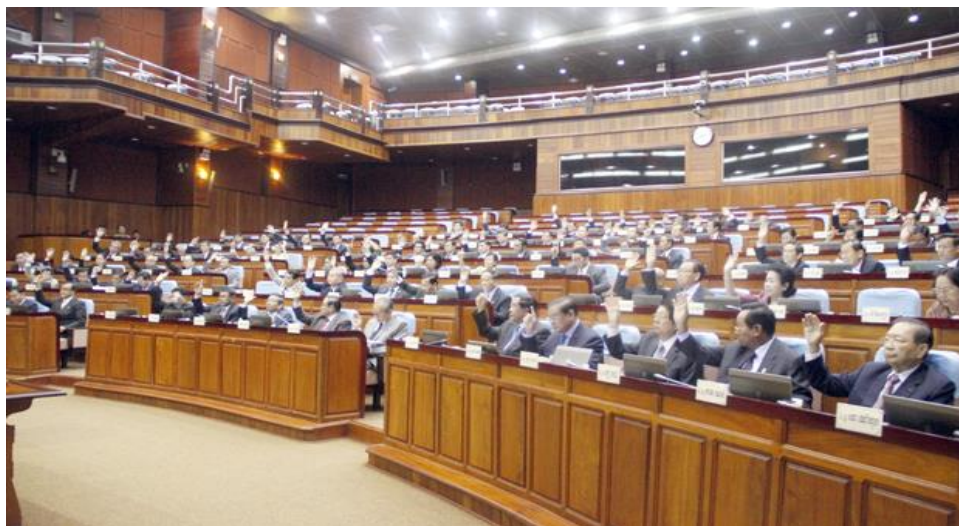
Lawmakers unanimously voted for the amendment of the Constitution during the 3rd session of the National Assembly of the 5th Legislature on 1st October 2014 in Phnom Penh.

The 120 Cambodian lawmakers present at the 3rd session of the National Assembly (NA)'s fifth legislature have unanimously endorsed the amendment to the Article 76 and all articles from new Chapter 15 to new Chapter 16 of the Constitution to make the National Election Committee (NEC) a constitutionally mandated and independent body.