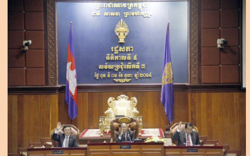
National Assembly President Heng Samrin (Centre) presides over the 3rd plenary session of the NA's fifth legislature.

of the assembly's commission on human rights, complaints, and investigation, said.