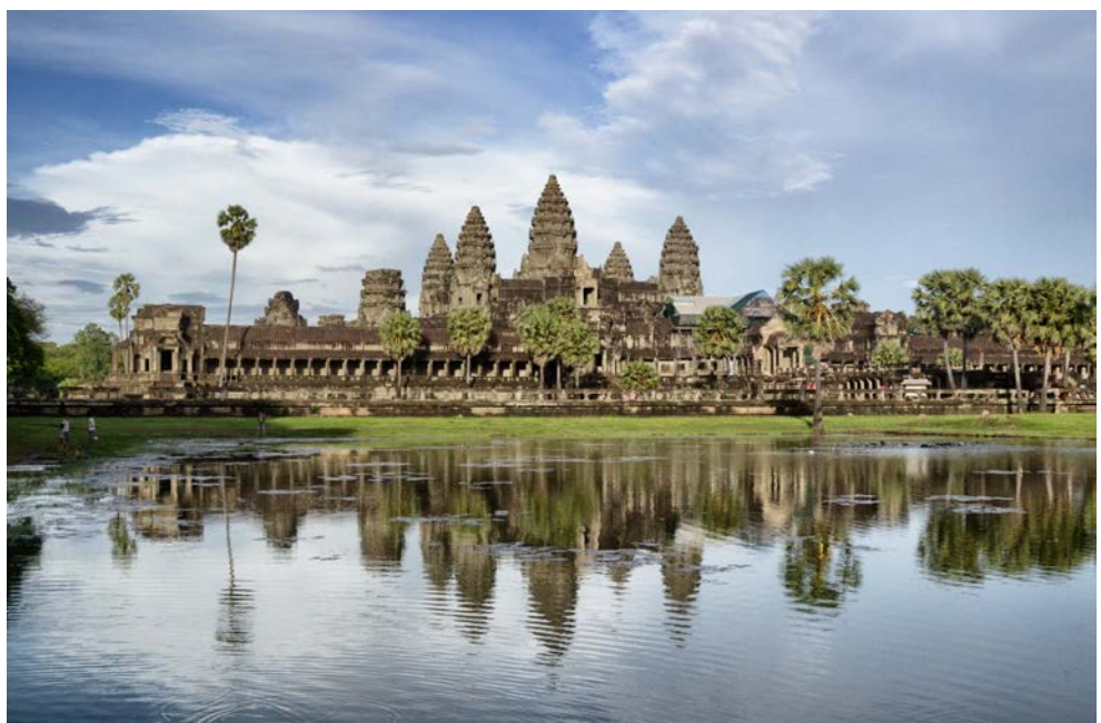
Angkor Wat Temple located in Siem Reap

TripAdvisor, a travel-planning website, has ranked Siem Reap as the top destination in Asia and fifth best travel destination worldwide in its annual Traveller's Choice Destination awards, experts said on 23 March, 2016.