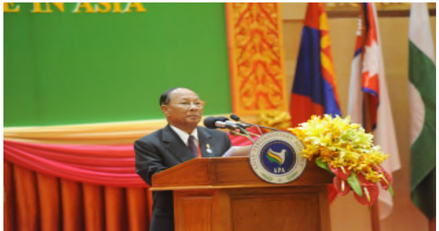
Cambodia's National Assembly President Heng Samrin marked his presidency of Asian Parliamentary Assembly (APA) for the next two years, at the 8th APA plenary session held on 9 – 11 December 2015.

Cambodia hosted the Eighth Asian Parliamentary Assembly (APA) in Phnom Penh from 9 -11 December under the theme "Promoting Peace, Reconciliation and Dialogue in Asia."