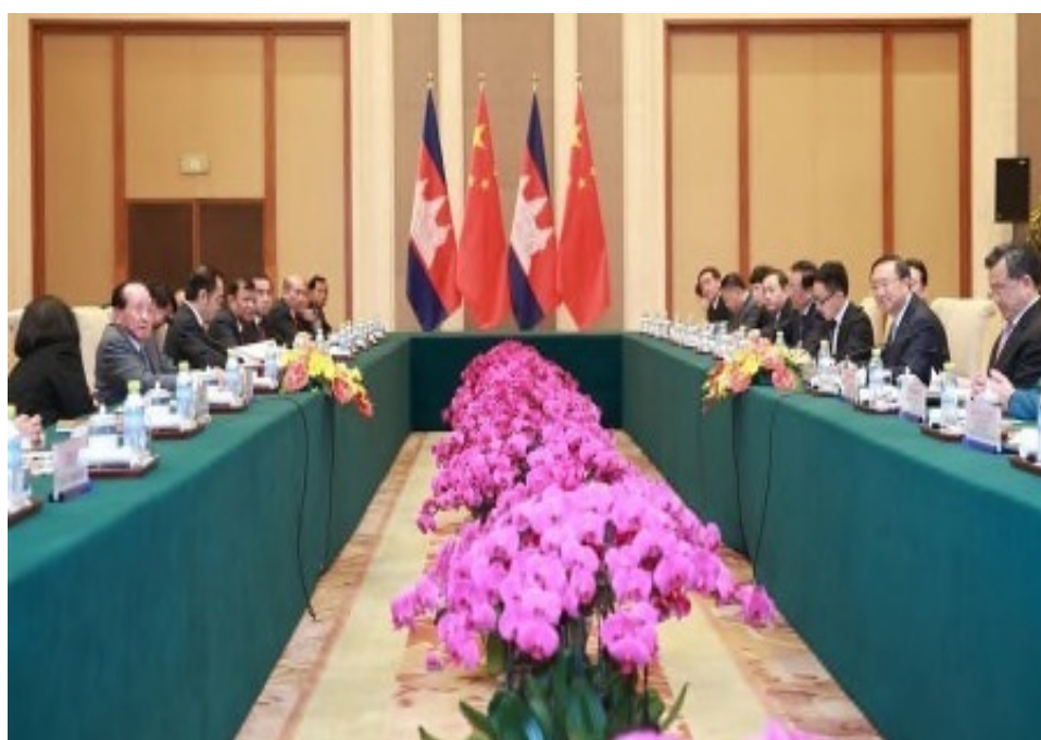
Cambodia's DPM H.E. Hor Namhong meets with H.E. Yu Zhengsheng, Chairman of Chinese People's Political Consultative Conference, during his visit to China to co-chair the 3rd Meeting of the Inter-Governmental Coordination Committee between the Royal Government of Cambodia and the Government of China, taking place in Beijing on 3-5 February 2016.

Senior officials of Cambodia and China discussed and agreed on numerous points to expand more cooperation in different fields at the 3rd Meeting of the Inter-Governmental Coordination Committee between the Royal Government of Cambodia and the Government of China, taking place on 3-5 February in Beijing.